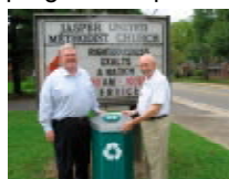
Jasper United Methodist Church

Since May a reported 407 bags of recyclables was collected and diverted from landfills by local businesses that are committed to the KPB recycling program. The newest members of the recycling program include Jasper United Methodist Church, Discount Tire and Natural Market Place. The Pickens County Board of Education, Jasper Elementary School and Pickens High School all have extensive recycling programs in place.