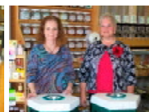
Natural Market Place